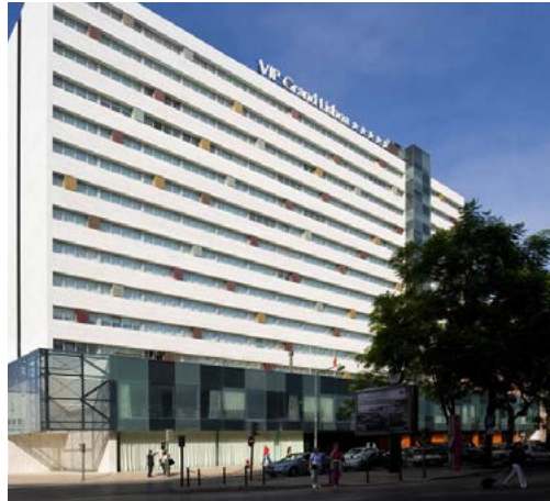
VIP ARTS HOTEL