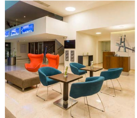
TRIP ORIENT HOTEL